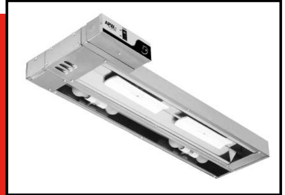
C*RADIANT™ LIGHTED SINGLE OVERHEAD